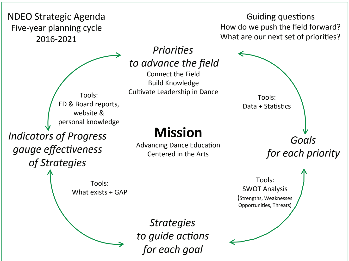
Figure 1. NDEO's Strategic Agenda Planning Cycle.